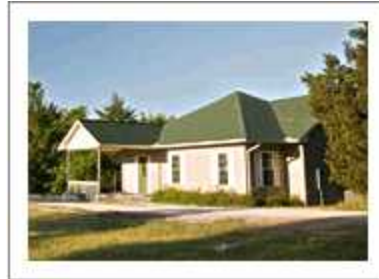
The Roadrunner Hideaway